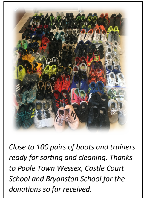
Close to 100 pairs of boots and trainers ready for sorting and cleaning. Thanks to Poole Town Wessex, Castle Court School and Bryanston School for the donations so far received.

With thanks to our relationship with Sports Direct, we are able to buy at a reduced rate, new trainers, boots, shin pads and gloves to add to our stock.