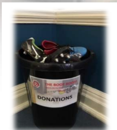
Donation bins pop up in schools across Dorset

THE BOOT ROOM was launched at the end of 2019 and its inception came through our involvement with local schools whereby we became aware of a recurring issue – many children being unable to take part in school sports because they do not have the necessary footwear.