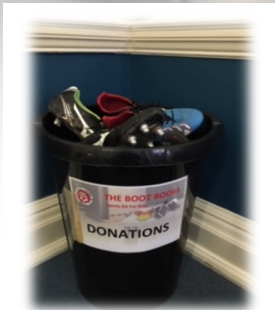
Donation bins pop up in schools across Dorset

THE BOOT ROOM was launched at the end of 2019 and its inception came through our involvement with local schools whereby we became aware of a recurring issue – many children being unable to take part in school sports because they do not have the necessary footwear.