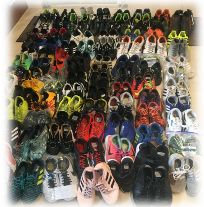
Close to 100 pairs of boots and trainers ready for sorting and cleaning in 2020. Thanks to Poole Town FC Wessex, Castle Court School and Bryanston School for those donations.

The following page gives details of some of the donations we have made over the past few years.